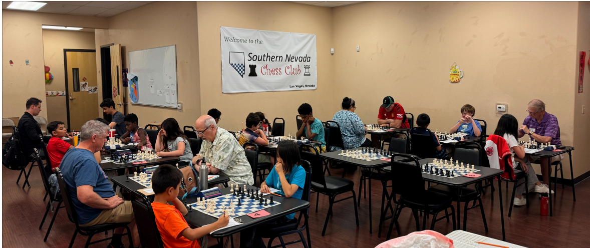
Our recent Beginner and 700+ Tournament