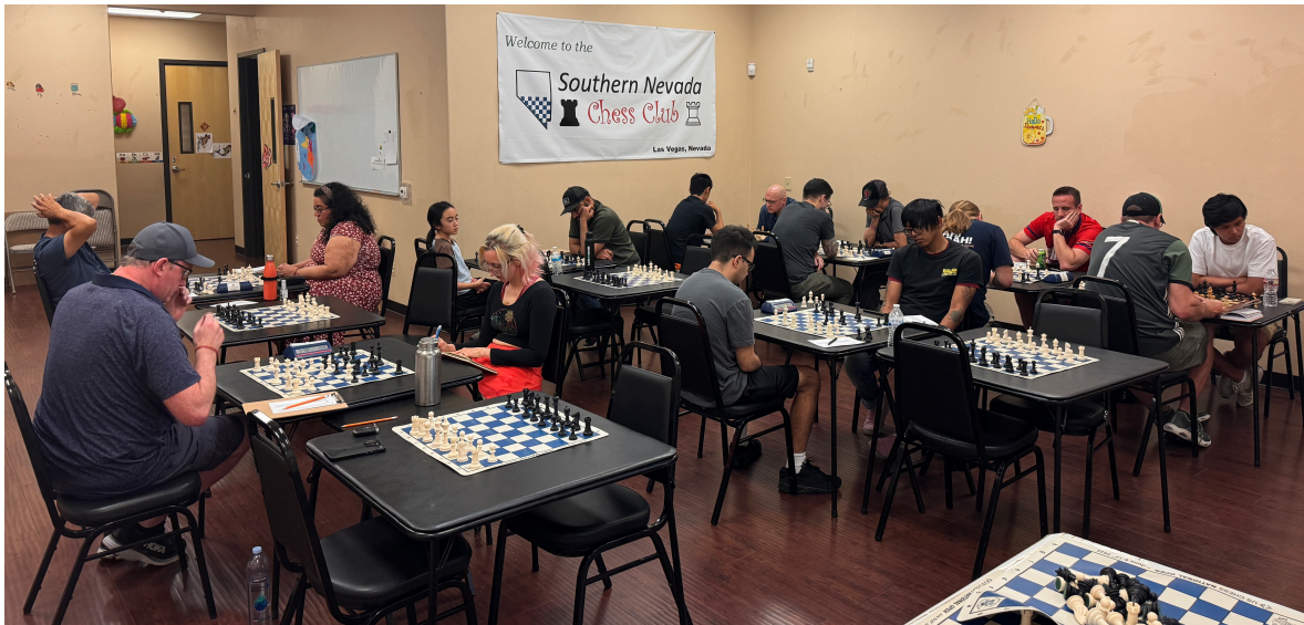
July Thursday Night Series Round 1